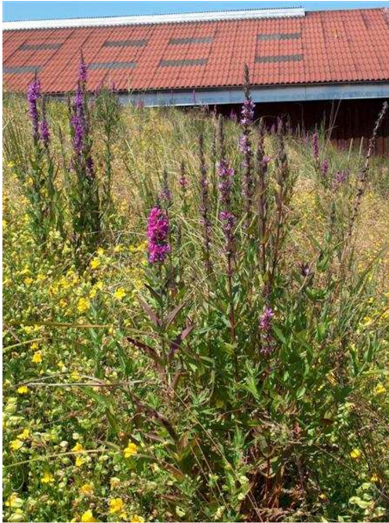
Purple loosestrife (Lythrum) and monkey flowers (Mimulus) on a wetland roof (2006)

A wetland roof is an energy saving air-conditioning system with numerous particular ecological functions which offer promising advantages especially for global centres of population like megacities, for example.