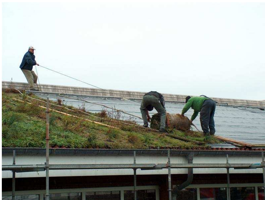
Installation of the plant mats

The selected types of wetland or marsh plants will be pre-cultivated on mats of non-woven material for one year before becoming part of a wetland roof structure. For the cultivation, textile base mats for plants are used with a considerable water accumulating capacity ensuring at the same time a mechanical protection for the roof skin. After approximately four months, they will be completely penetrated by roots, and the mat strips are then ready to be installed on the roof.