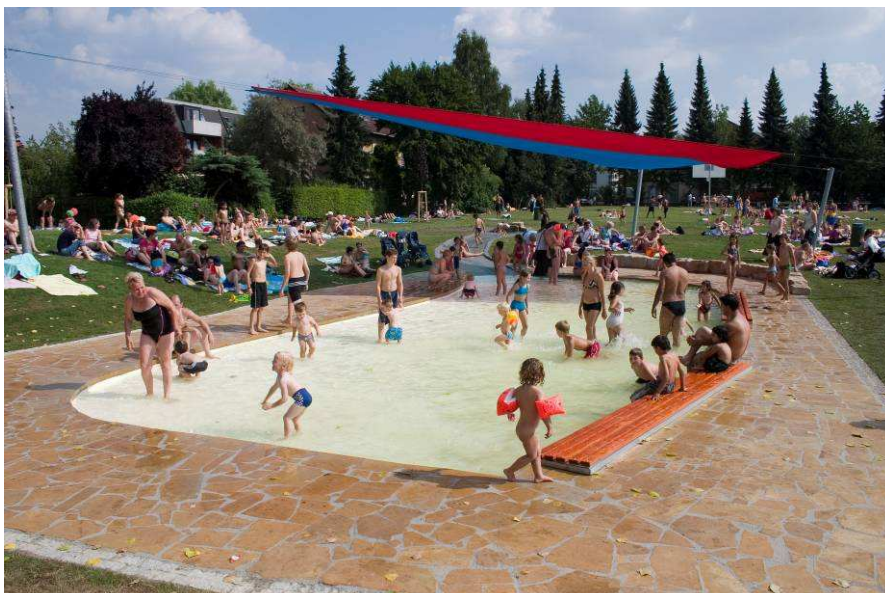
Photo: Paddling pool

The water treatment plant is dimensioned for an average number of 1,186 swimmers. It works without any chlorine/chlorine dioxide.