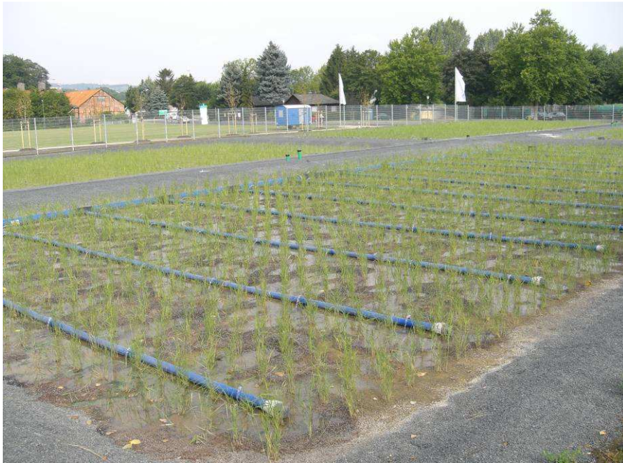
Photo: Constructed wetlands with reed in an early stage of the plant development