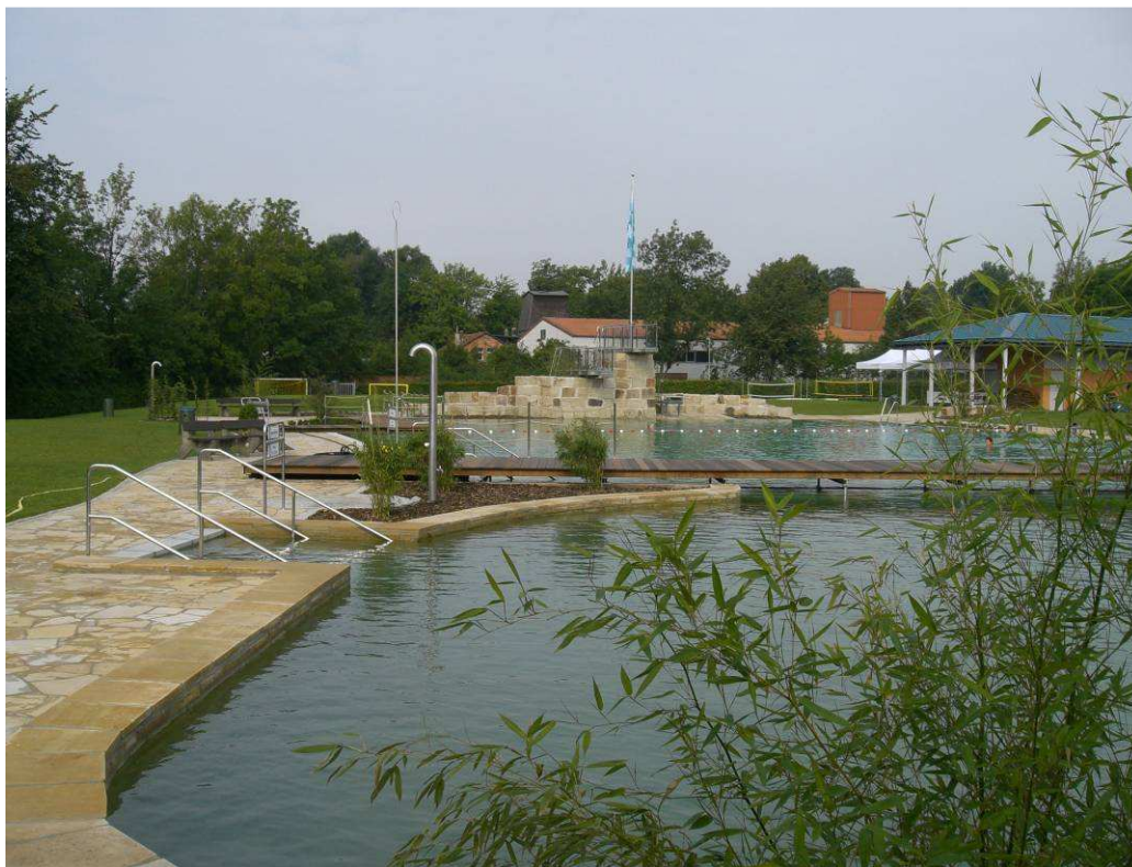
Photo: Swimmers' and non-swimmers' pools

Redevelopment and conversion to outdoor natural pools, construction of a constructed wetland (reed), modification of the entrance and parking area