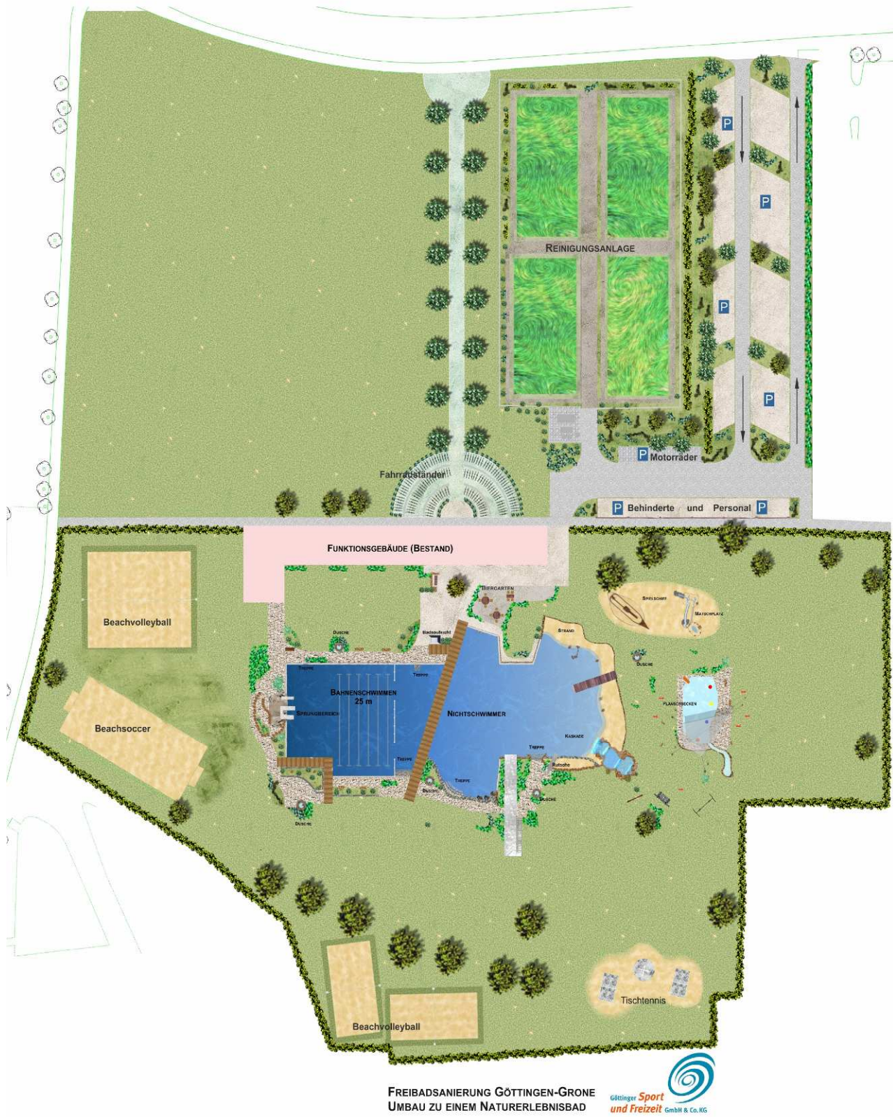
Illustration: Overview of the terrain